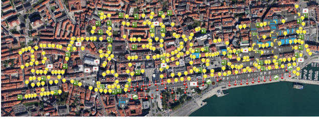
Fig. 3: SmartSantander sensors locations